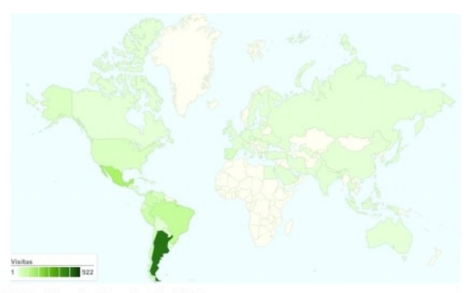
2.126 visitas de 61 países/territorios